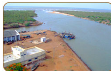
PICTURE.2 Nizampatnam Port.