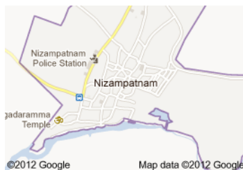
PICTURE.1 Nizampatnam Map

Nizampatnam, also known as Petapolly (Peddapalli), is a seaport town in Andhra Pradesh state of southern India. Nizampatnam is located in Guntur District, of which it is a mandal, in the delta of the Krishna River, which empties into the Bay of Bengal. The Dutch occupied the city as a trading post from 1606 to 1668. A medium-sized modern port complex is planned for Nizampatnam, which will include terminals for bulk cargo, intermodal containers, and liquefied natural gas. A multi-product special economic zone, including a urea manufacturing facility and an electrical power station, may be built in conjunction with the port complex. There are 15 villages in this mandal, which was formed on 14 January 1987. The social reformer and freedom fighter Duggirala Gopala Krishnaiah comes from Penuganchiprolu village of Krishna District.